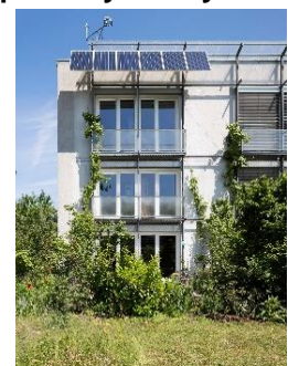
The world's first Passive House building in Darmstadt-Kranichstein.

The Passive House Standard already meets the EU requirements for Nearly Zero Energy Buildings. According to the European Buildings Directive EPBD , all member states must specify requirements for so-called NZEBs in their national building regulations. These came into effect in January 2019 for public buildings and will apply for all other buildings from the year 2021.