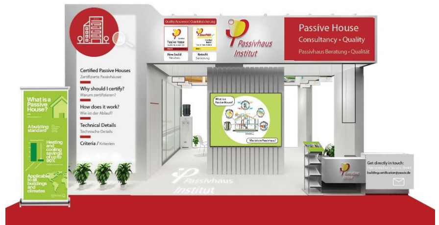
For three weeks, the virtual Passive House Exhibition gives visitors the chance to explore products from the world of energy efficient construction and retrofiting. There will also be tours through the exhibition and the exhibitors can be contacted in the live chat.

The right components are necessary for putting climate-friendly construction into practice. Therefore, the Passive House specialists' exhibition constitutes an integral part of every Passive House Conference. For the online conference, the specialists' exhibition has also been turned into a virtual event. The conference participants will thus have the whole three weeks to become familiar with products for energy efficient construction and retrofiting. Virtual tours and personal contact with the manufacturers are also included. The Passive House specialists' exhibition will already open its virtual doors on 17 September 2020.