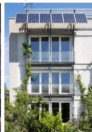
Construction of the first Passive House building in the world began 30 years ago. Right: The current state of the building with a subsequently added PV system.