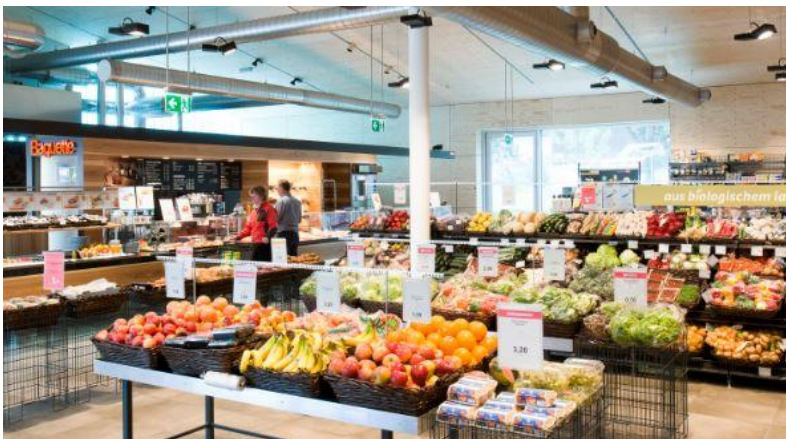
Passive House supermarkets: An Austrian company shares its experiences.

Another first is our all-inclusive ticket for presentations (with links to the videos), specialists' exhibition, excursions and networking. The ticket provides access for the whole three weeks.