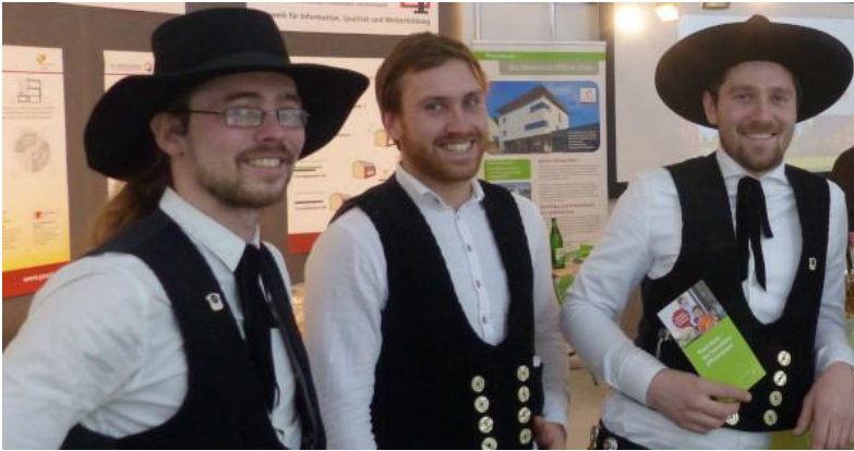
By attending the conference, Passive House tradespeople and designers receive credit points for renewing the certificates.