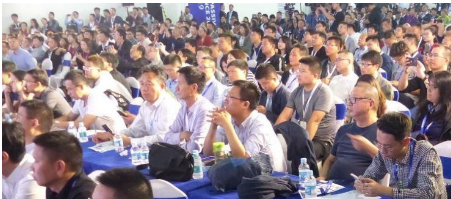
More than 20 lecture series, workshops, presentation of certificates and award ceremonies for the winners of the Component Award and the Innovation Award – all this was well-received by the Conference participants of the 23 rd International Passive House Conference in Gaobeidian.