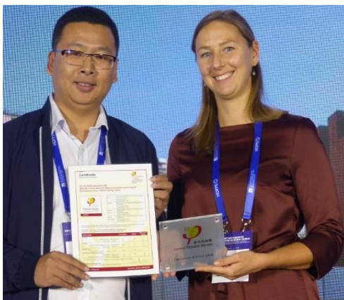
At the Conference, the Passive House Institute also presented certificates for Passive Houses.