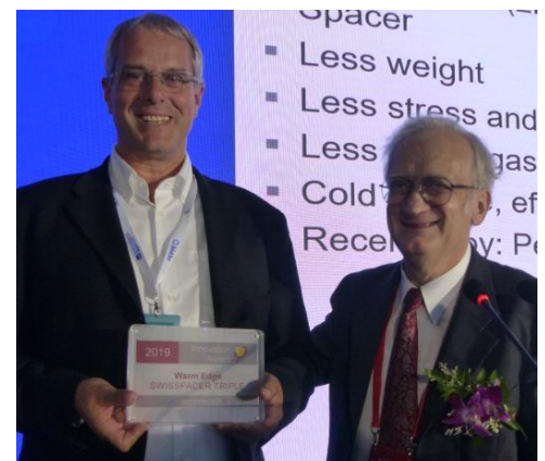
Four companies received the Innovation Award 2019 in Gaobeidian.

In Gaobeidian, many manufacturers of Passive House components were awarded a certificate for their products. In addition, the winners of the Component Award and the Innovation Award were presented by the Passive House Institute. The Innovation Award went to the following companies: