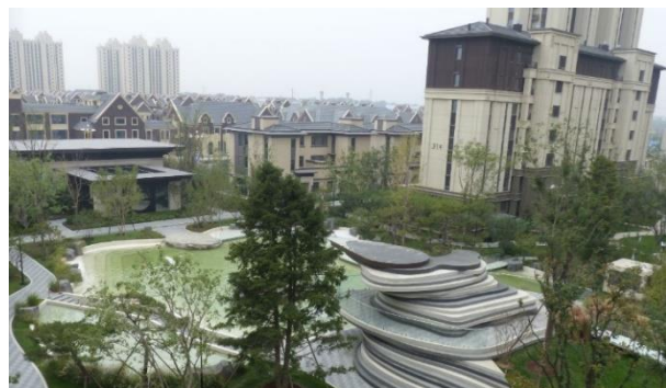
The Passive House Institute and the international network iPHA were also represented at the Specialist Exhibition in Gaobeidian (left). Excursion to the Passive House settlement Bahnstadt Gaobeidian (right).