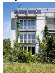
The world's first Passive House building in Darmstadt-Kranichstein.