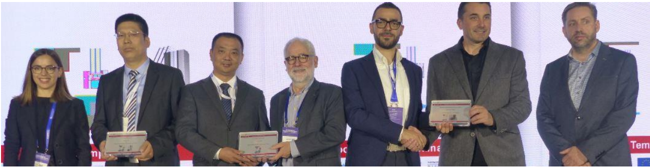
23 companies from 12 countries took part in the "Windows for the future" Component Award 2019. The 14 award winners are individually listed on the website of the Passive House Institute.