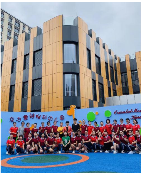
During the 24th International Passive House Conference, there will be presentations on Passive House projects from around the world. One of these projects is the X88 kindergarten in Beijing.

The 16 different lecture series during the 24 th International Passive House Conference will include presentations on Passive House districts and non-residential buildings built to the Passive House standard, as well as multi-storey Passive House projects . A separate series will deal with Passive House projects worldwide : this will include presentations on a Passive House guesthouse in the Swedish city of Gothenburg, the first Passive House building in Thailand,