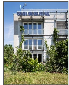
The world's first Passive House building in Darmstadt-Kranichstein.