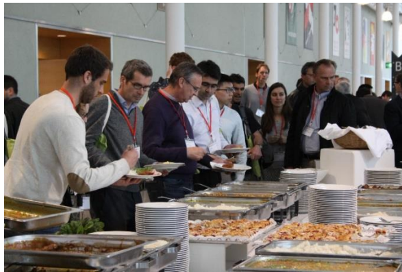
'Passive House for All' was the focus of the 21st Passive House Conference in Vienna.