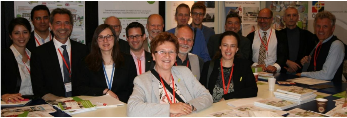
The Passivhaus Institute, together with Passivhaus Austria (picture), invited participants to Vienna.