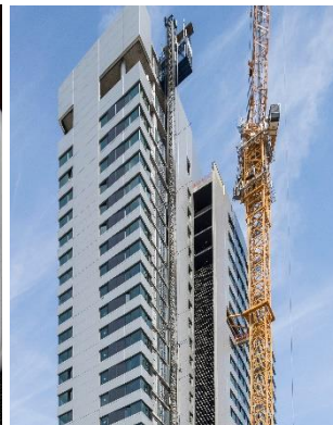
Three Passive House presentations (f.l.t.r.): Passive House Temple Tochoji in Tokyo, mobile Passive House from the 3D printer and Passive House high-rise Cornell Tech in New York.