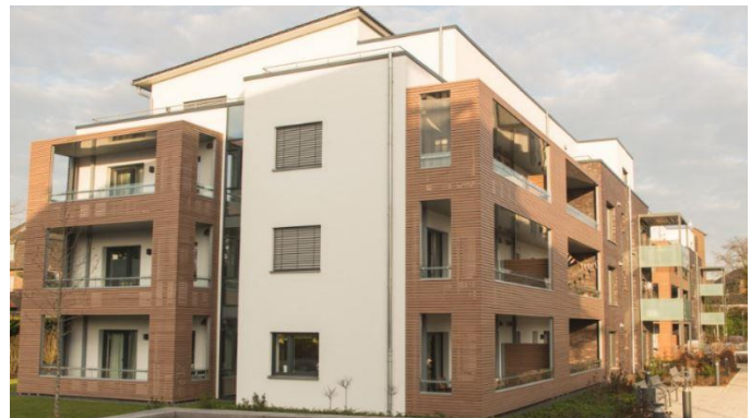
Projects at #25intPHC: A students' hostel in Vienna, Austria (above) and climate-friendly housing settlement in Kleve (Germany): Passive house buildings require very little energy for heating and cooling and thus effectively protect the climate. © G. Reinberg/Reppco Architekten