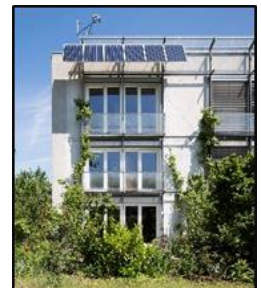
The world's first Passive House building in Darmstadt, Germany celebrates its 30 th anniversary this year.

In a Passive House building the heat is retained for a very long time since it escapes very slowly. A very small amount of energy is required in total. In the summer (and also in hot climates), a Passive House building also offers advantages: among other things, the excellent level of insulation ensures that the heat stays outside, therefore active cooling usually isn't necessary in residential buildings. Due to the low energy costs in Passive House buildings, the utility costs are foreseeable - a fundamental principle for affordable homes and social housing.